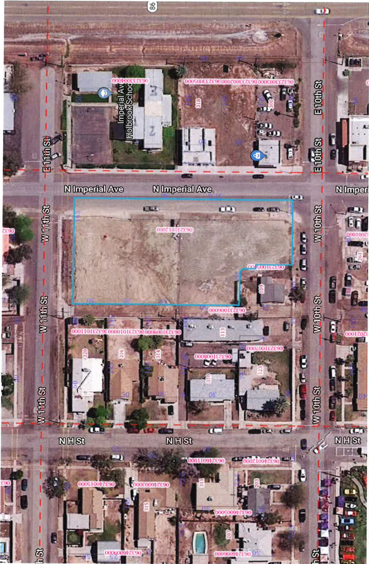
Exhibit A: Imperial Senior Apartments