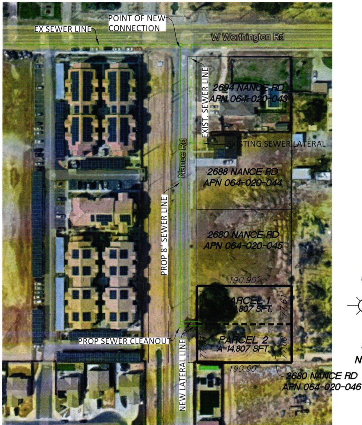
EXHIBIT "A" CITY OF IMPERIAL - REQUEST FOR SEWER CONNECTION

Dynamic Consulting Engineers, Inc. 2415 Imperial Business Park Drive, Suite B Imperial, CA 92251