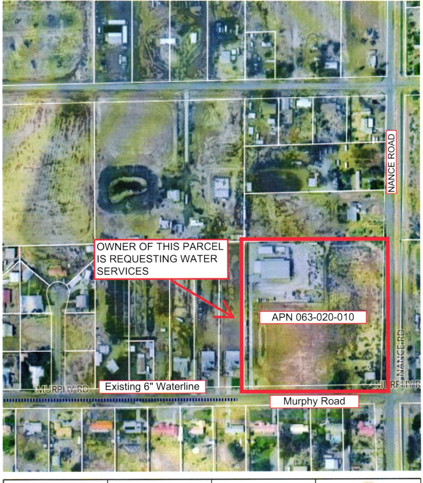
EXHIBIT A 604 W Murphy Road