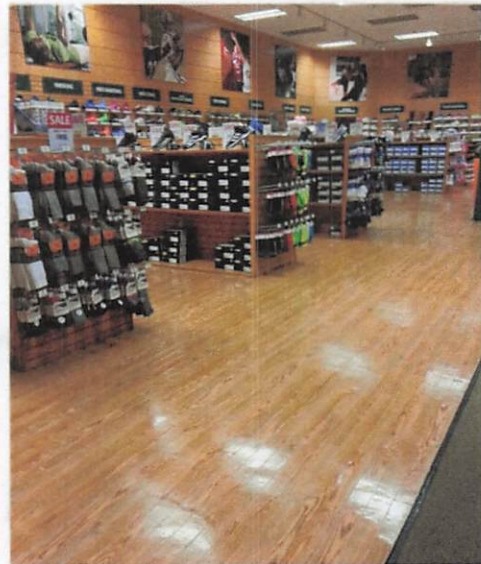
Dick's Sporting Goods San Diego, CA