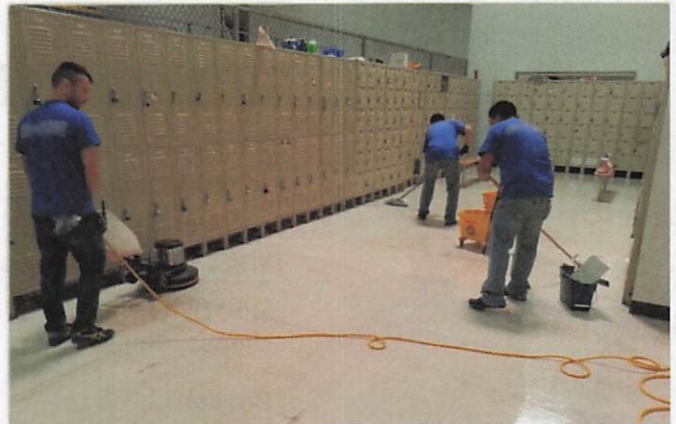
Burlington Coat Factory San Bernardino, CA