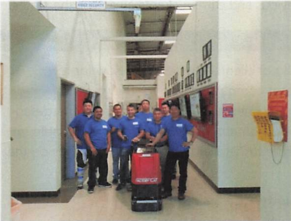
Base Hill Floor Team