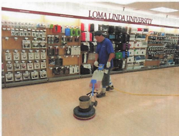
Loma Linda University Loma Linda, CA