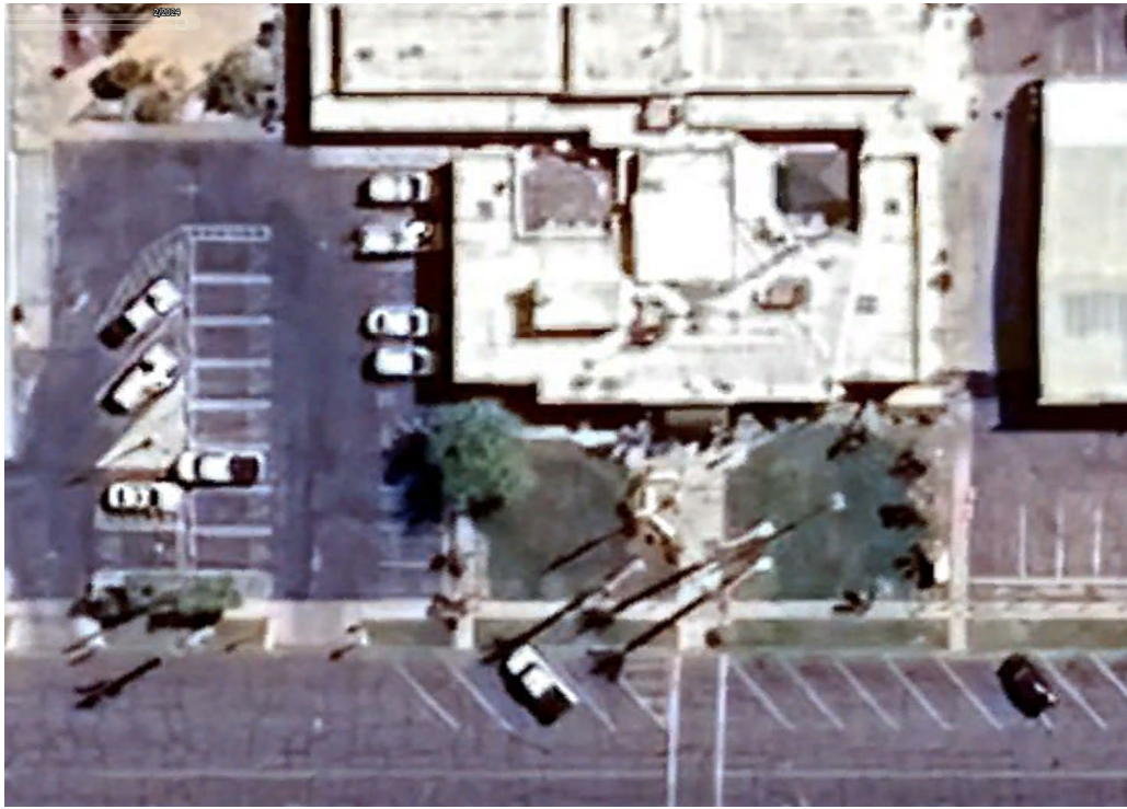
Existing Parking on S. Imperial Avenue Between 4 th and 5 th Streets